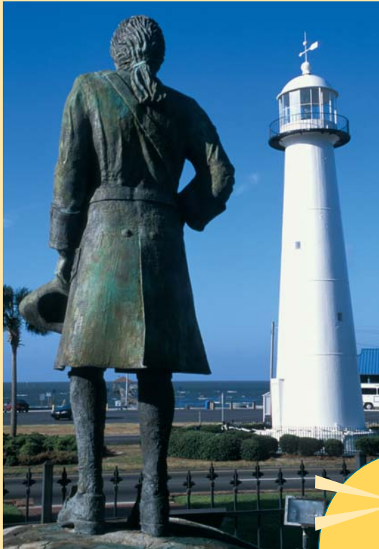
Pierre LeMoyne D'Iberville landed off the Mississippi Gulf Coast in 1699, memorialized in this statue by the lighthouse.